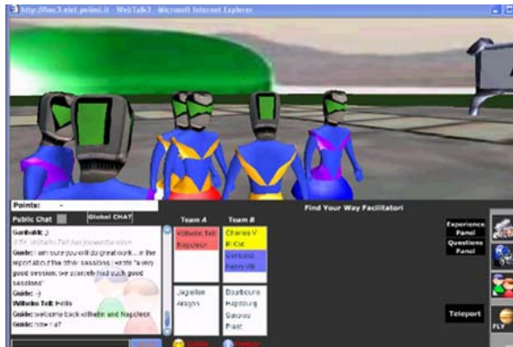
Students meet and present their works.