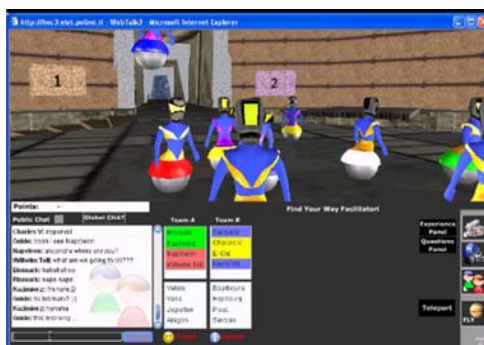
Students meet for the first time in the Meeting Point