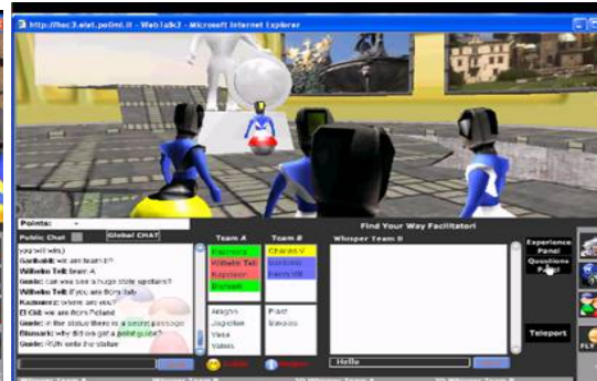
Students introduce themselves, their town and country in the City Domes.