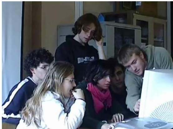
Meanwhile, at the 2D chat, other groups of students must answer complex conceptual questions.