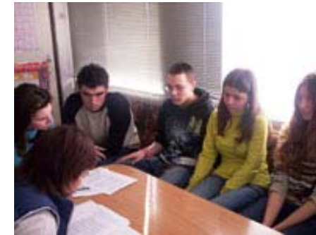
Before Session 3 students read material about some European cross-national issue (e.g. language, religion, welfare).