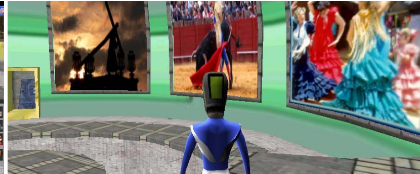
They show pictures previously sent: the green class in the green Dome, the yellow class in the yellow Dome, and so on...