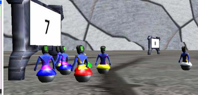
A discussion follows: students answer quizzes about the interviews they studied.