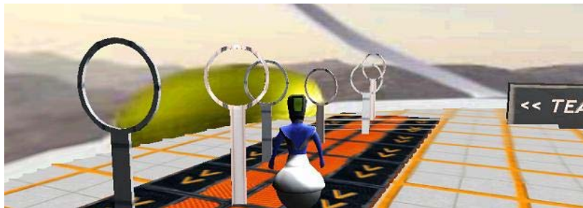
Let the Games begin! An avatar plays in the Olympic Games, while his team partners answer quizzes about the preliminary interview (which they read before Session 1).