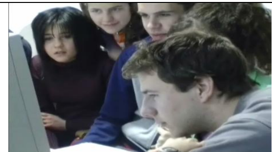
Before Session 2 students study the history of the countries involved, search material evidence of their history in their local surroundings, and describe their daily life. They compare findings with their remote team partners on the forum.