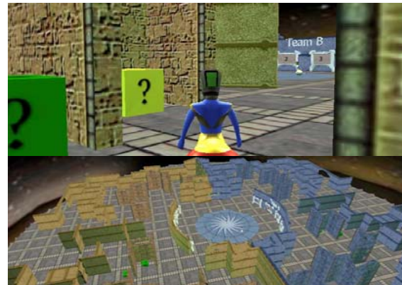
Next, a Treasure Hunt takes place in a Labyrinth. Students must collaborate to select 4 objects basing on a clue.